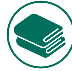
bed sheets and towels

The cotton industry employs more than 100 million people and it is one of the top five global soft commodities in terms of annual consumption (along with cocoa, coffee, wheat and sugar).