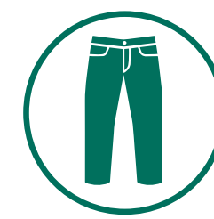
canvas and denim